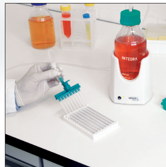
Aspiration from Western blot strips