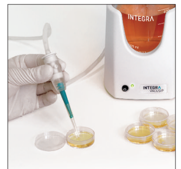
Removal of culture media