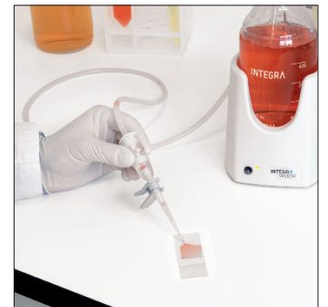
Removal of excess liquid from object slides