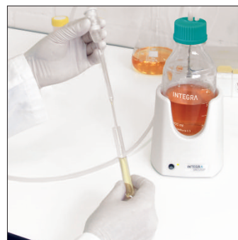
Supernatant removal to harvest bacteria