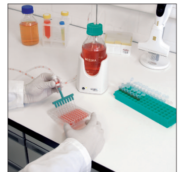
Removal of washing solutions