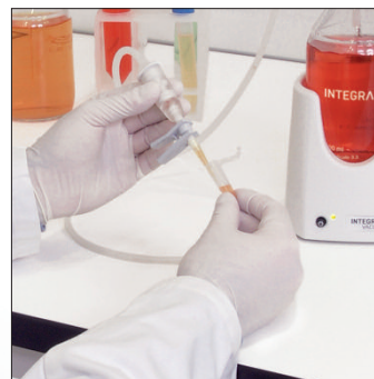
Aspiration of supernatants