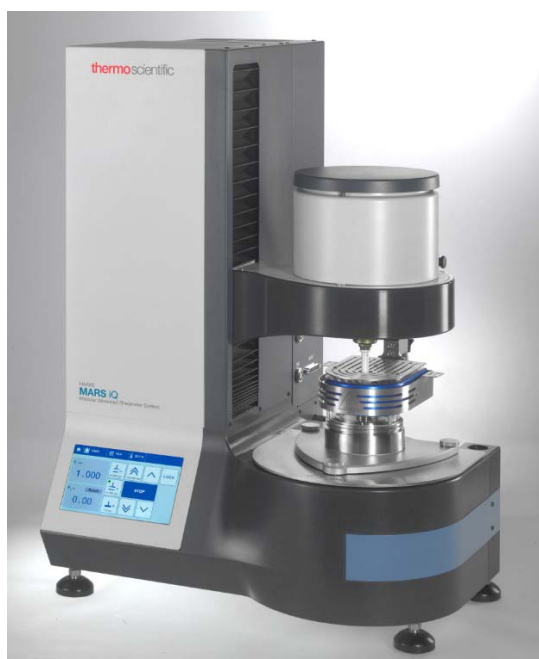
Fig. 1: HAAKE MARS iQ Air Rheometer.