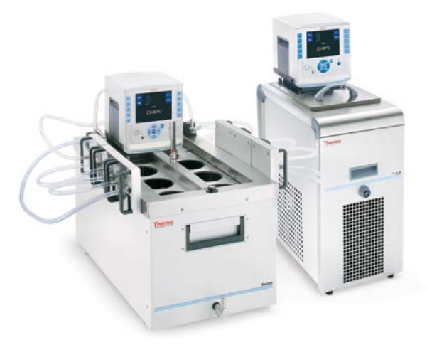
Thermo Scientific<sup>™</sup> Horizon<sup>™</sup> Fog Testing System configured with the PC-FTS controller, the PC200-A25, and the reflectometric accessory kit

With our extensive global footprint service and support is just a click or phone call away.