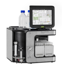
Reveleris® PREP A high-performance system with integrated flash and preparative HPLC in a single compact system