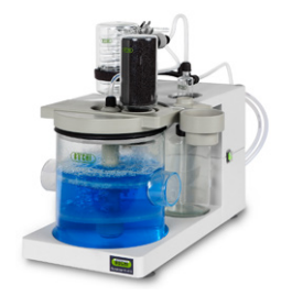
Scrubber K-415 Neutralization