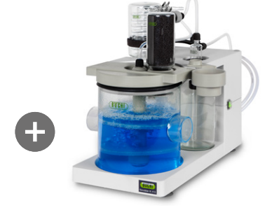
Scrubber K-415 Neutralization