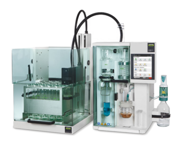
KjelMaster System K-375 / K-376 / K-377 Steam distillation, titration and auto sampling