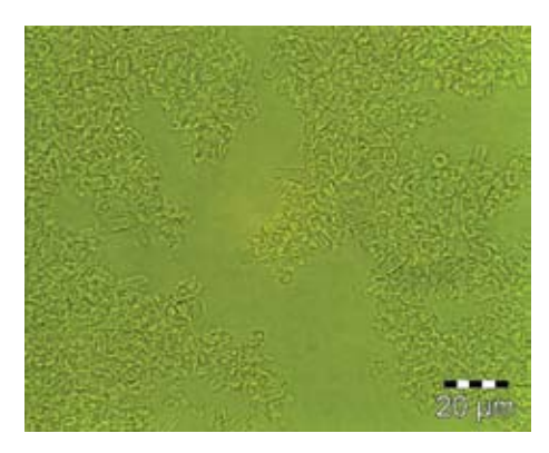
S. pombe - after