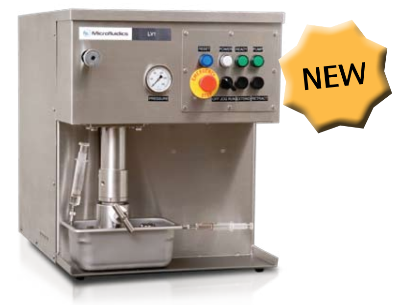
Model shown is subject to change depending on options selected