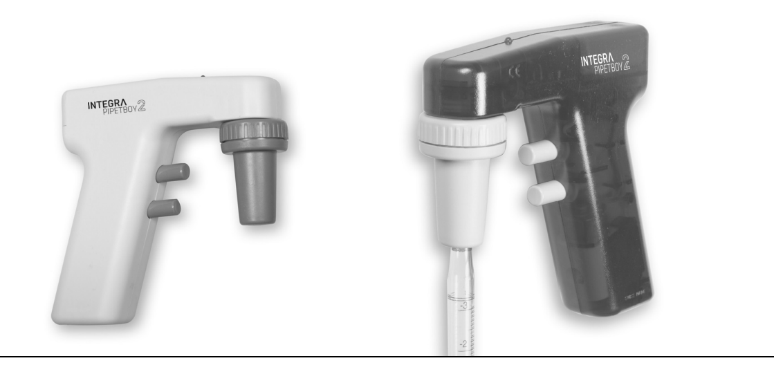
PIPETBOY acu 2 Operating instructions