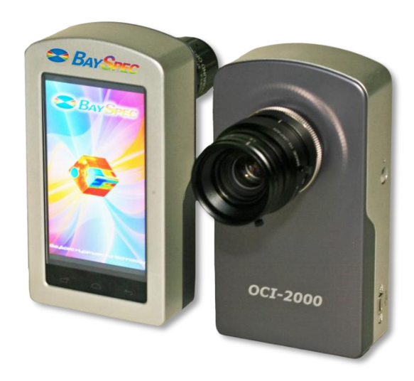
OCI-2000HH™ Handheld Snapshot Imager